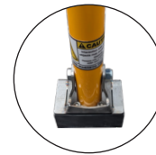
STAINLESS STEEL BASE PLATE