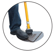
EASY TO REMOVE