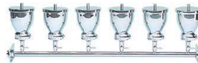
AS 610/3 showing rapid clamp closure