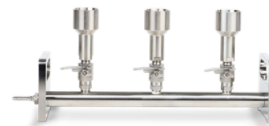
Stainless steel 3-place manifold