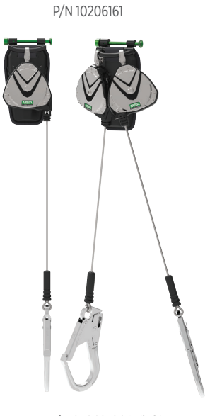
P/N 63062-00A (left) P/N 63162-00A (right)

Note: This Bulletin contains only a general description of the products shown. While product uses and performance capabilities are generally described, the products shall not, under any circumstances, be used by untrained or unqualified individuals. The products shall not be used until the product instructions/user manual, which contains detailed information concerning the proper use and care of the products, including any warnings or cautions, have been thoroughly read and understood. Specifications are subject to change without prior notice. MSA is a registered trademark of MSA Technology, LLC in the US, Europe, and other Countries. For all other trademarks visit https://us.msasafety.com/Trademarks.