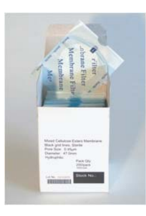
Sterile version membranes are individually sealed in easy to open pouches