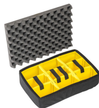
1505 Padded Divider Set