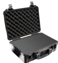
1500WF With Foam