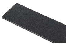
1500TPDIV Extra TrekPak Dividers