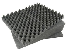
1501 3 pc. Replacement Foam Set