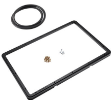
1500PF Special Application Panel Frame