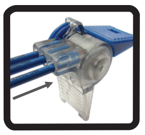
Insert striped wires into connector. The striped ends of the wires should be visible through the clear housing on the back.