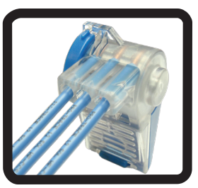
Hold wires in place while squeezing wings (handles) together until the latch snaps shut.