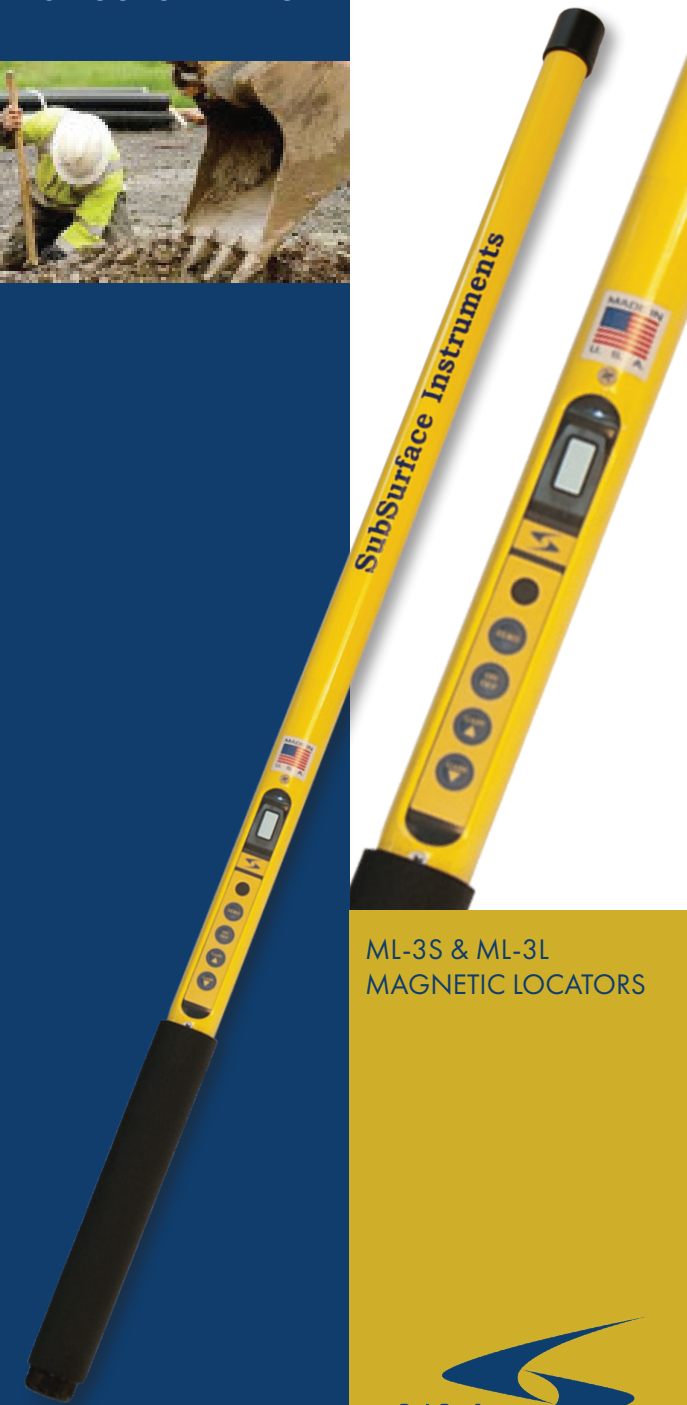
ML-3S & ML-3L MAGNETIC LOCATORS