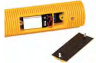
Easy Access Battery