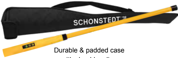
Durable & padded case with shoulder sling