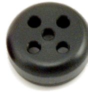
Open-faced Nose Cap