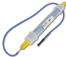
Drying Tube Assembly